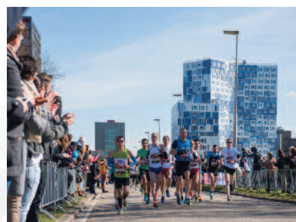
The Utrecht Science Park Marathon