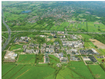
Utrecht Science Park and Bilthoven in the background.

Signing of the memorandum of understanding between Utrecht Science Park and Science Park Bilthoven for the development of the first science park in the Netherlands with a satellite location.