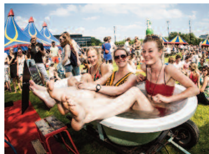
Festival deBeschaving in the Botanic Gardens