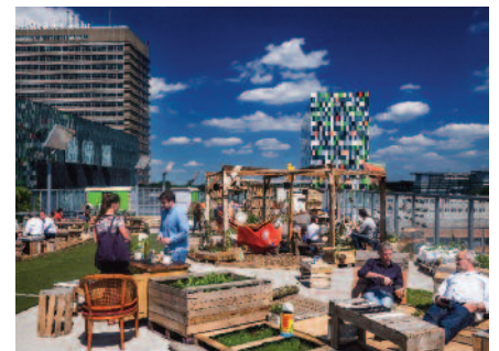
Rooftop garden on the top floor of a parking lot created by social entrepreneurs.

Utrecht Science Park is the only science park with its own festival! A surprising mix of live music, science and art in one of the most beautiful festival locations of the Netherlands: the Botanic Gardens at Utrecht Science Park.