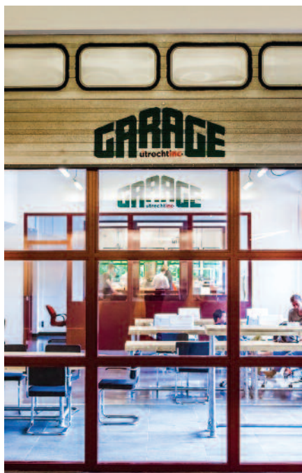
UtrechtInc's 'the Garage': a 'pre-incubator' where startups, researchers, companies and students experiment with innovative startup concepts which support the development of a healthy society.