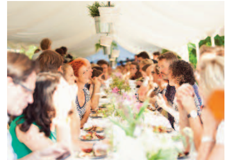
De Maaltuin, a pop-up restaurant in the Botanic Gardens, is one of the many examples of social entrepreneurship at Utrecht Science Park.

Utrecht Science Park has its own Marathon .